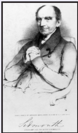
Henry Addington, 1 st Viscount Sidmouth

The Market Cross is built of Bath stone and was erected in 1814 at a cost of £1500. The money was provided by Henry Addington, a Devizes MP, who, after elevation to the peerage as Viscount Sidmouth, was 'reminded' by a Devizes colleague of his offer, in a conversation twelve years earlier, to pay for a new Market Cross! Although he denied ever taking part in such a conversation he did eventually provide the money to build it. During his time as MP he also provided £500 to rebuild the Shambles market hall.