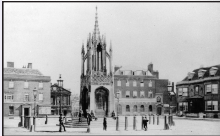
Market Cross, 1870's