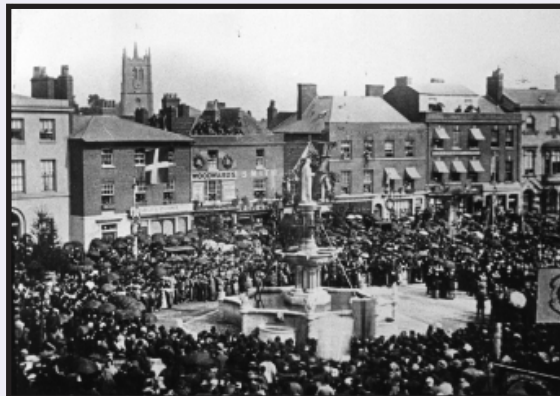
The fountain was built on 16 September 1879 amidst great celebrations

However, not all had gone well in the run up to the unveiling. Water refused to run through the fountain properly. It was the first use of mains water in the town and the pressure proved too strong for the fountain's plumbing. Instead of running neatly from the spouts into the bowl and then filling the large basin below it overshot them both and splashed onto the road! When the pressure was reduced water just dribbled miserably over the rim and down the central columns. A temporary solution was found just in time: rose attachments were fitted to the top spouts causing the water to spray upwards and so fall back neatly into the bowls