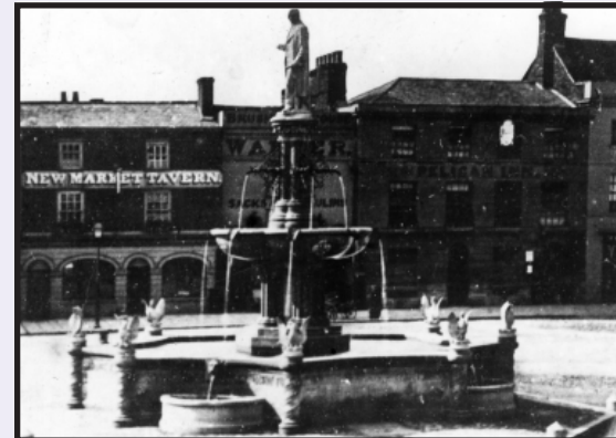
The fountain in its early days (c.1880) and working as originally intended