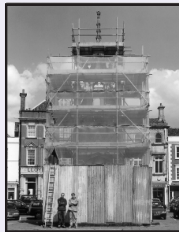
Repairs were carried out in 2001 by conservation specialists, Minerva