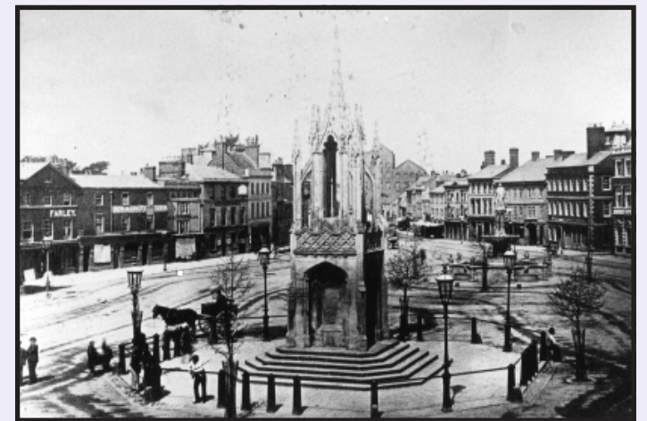
Market Place after a light fall of snow, c1890