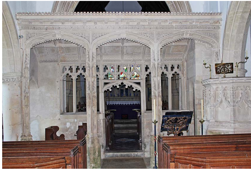
Superb 15 th century stone screen in the Church of St. Swithin, Compton Bassett

Where the church is unlocked we have taken photographs showing features of architectural interest, wall paintings, furnishings and fittings, and memorials.