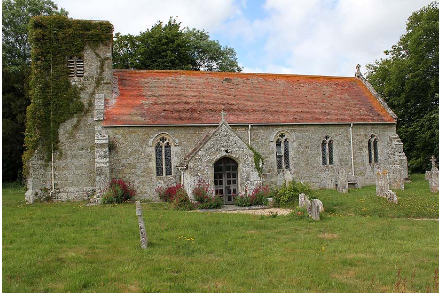
Church of St. Edith, Baverstock, in Dinton parish

visitors. There is an entry for every church and chapel with a brief history and photographs old and new.