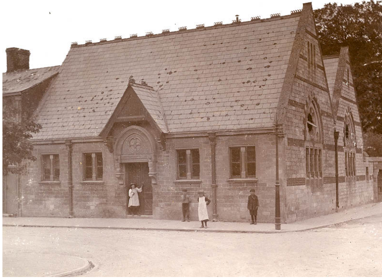
Pewsey National School c.1906

Other information about the parish includes the census population from 1801 to 2001 (2011 figures will be added as soon as they are available), a select booklist for the parish, archaeological sites, local authors and literary associations, a catalogue of wills from the 1530s to 1857 of people who died in the parish, and details of listed buildings, Ordnance Survey maps and newspapers.